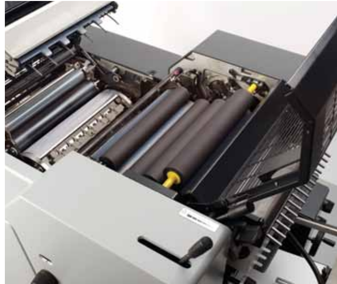
The BaumPrint 18 printing unit delivers superb color brilliance and top quality.

The key performance characteristics of the BaumPrint 18 feeder include outstanding sheet separation, precise sheet alignment and less waste.