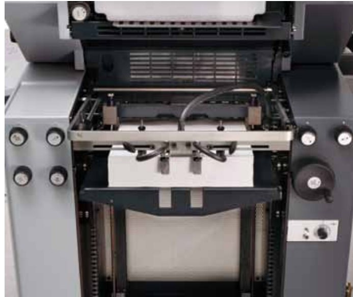
The compact single-sheet feeder can handle an exceptionally wide range of formats and printing stock.

With its high level of automation, the BaumPrint™ 18 creates the ideal conditions for cost-effective production of one- two-, and multi-color jobs