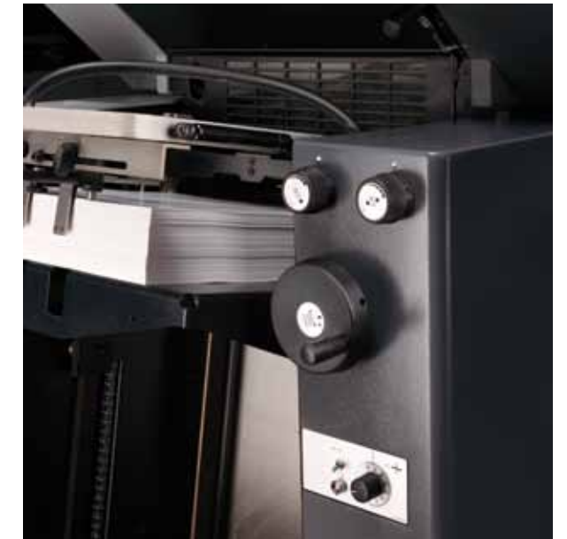
The well illuminated delivery can be adjusted for all kinds of formats and materials quickly and without tools.

Printing, numbering, and perforating in a single pass. The numbering device makes your press even more versatile, speeds up job processing and satisfies special customer requirements. A comprehensive range of add-ons enables you to extend the range of applications your press can handle.